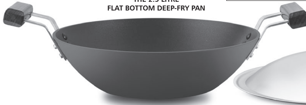
THE 2.5 LITRE FLAT BOTTOM DEEP-FRY PAN